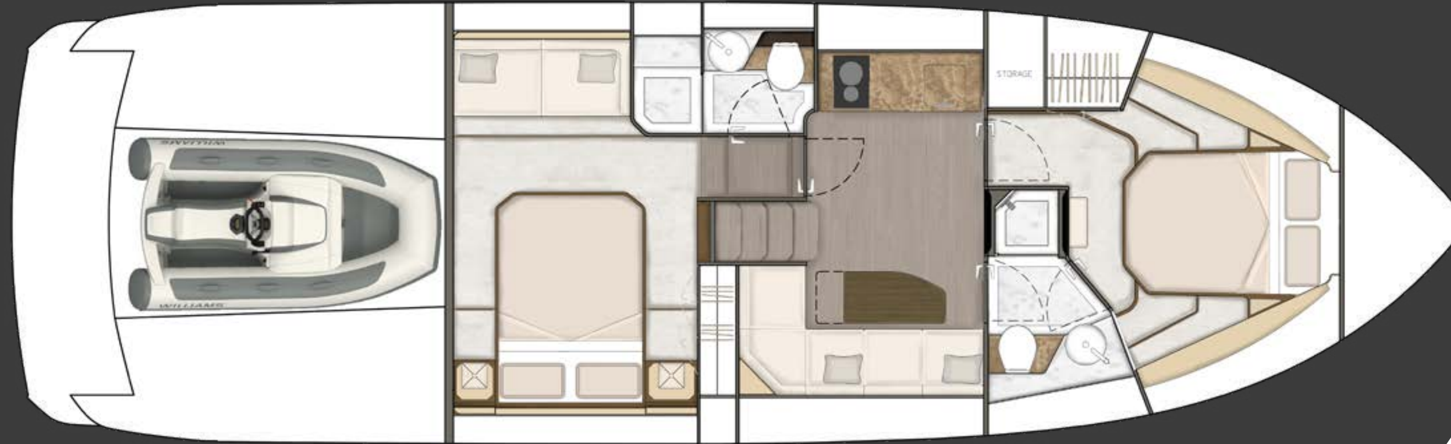
MID MASTER CABIN