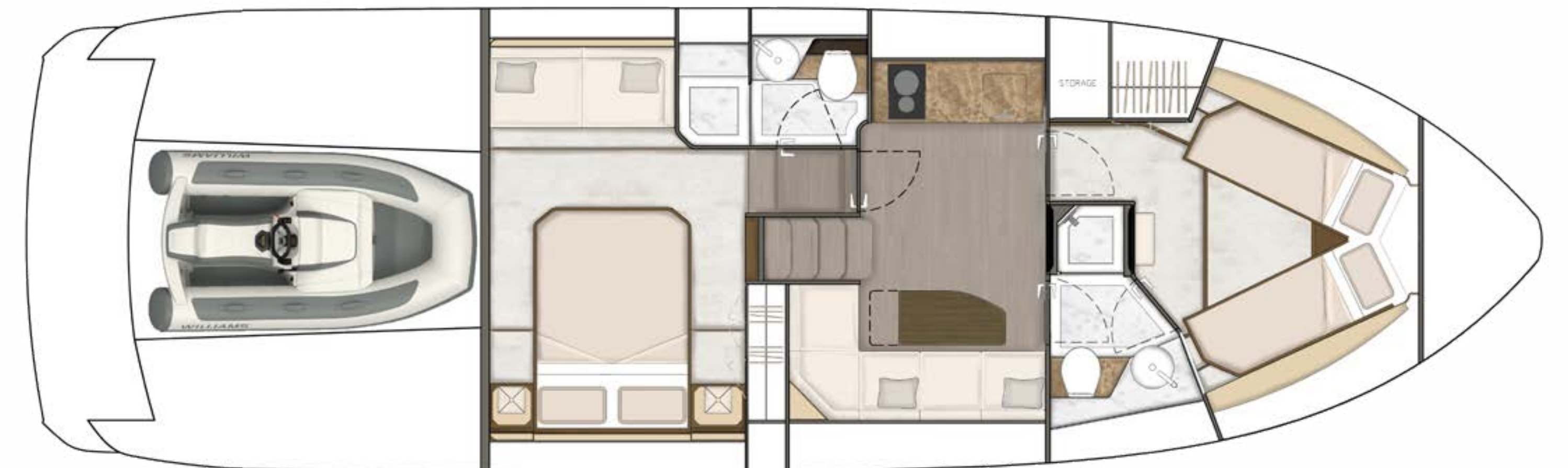
FORWARD SCISSOR BERTH