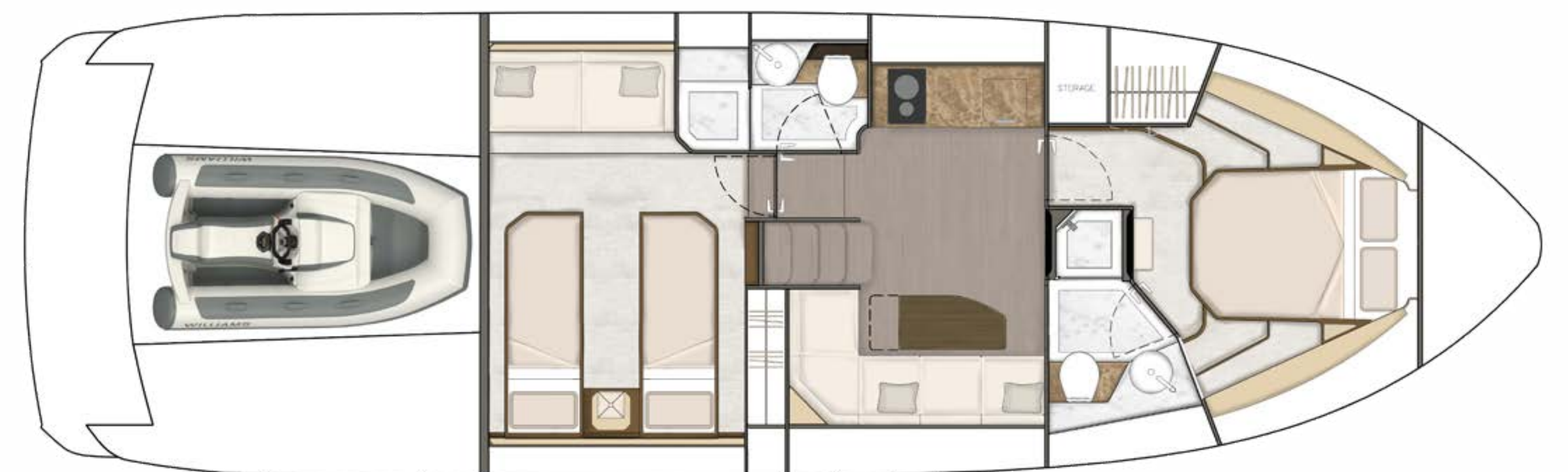
MID CABIN TWIN