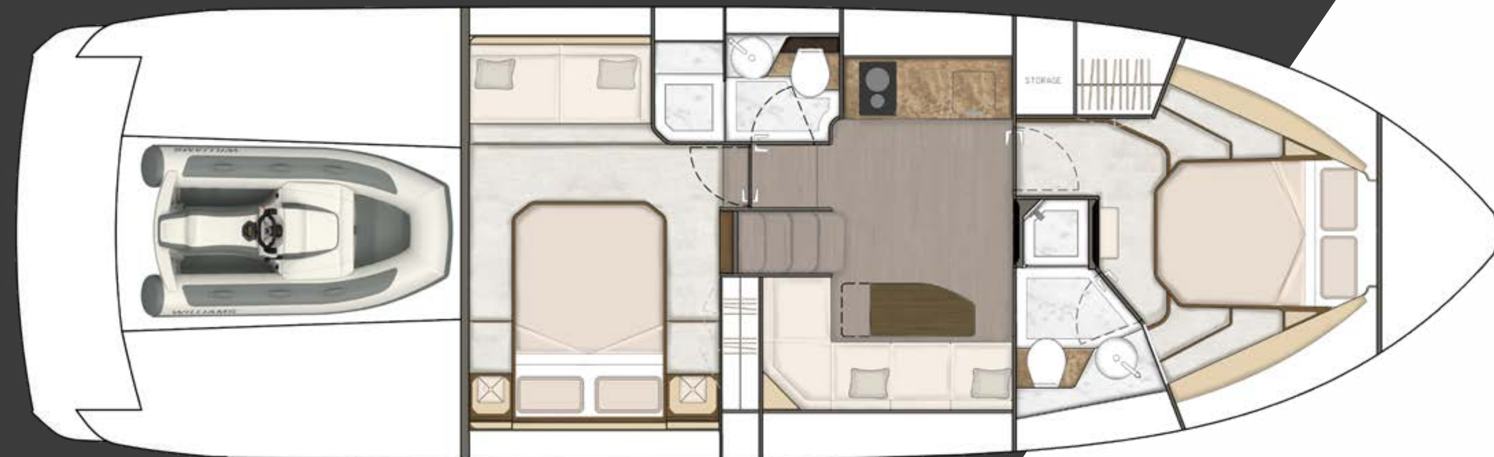
FORWARD MASTER CABIN